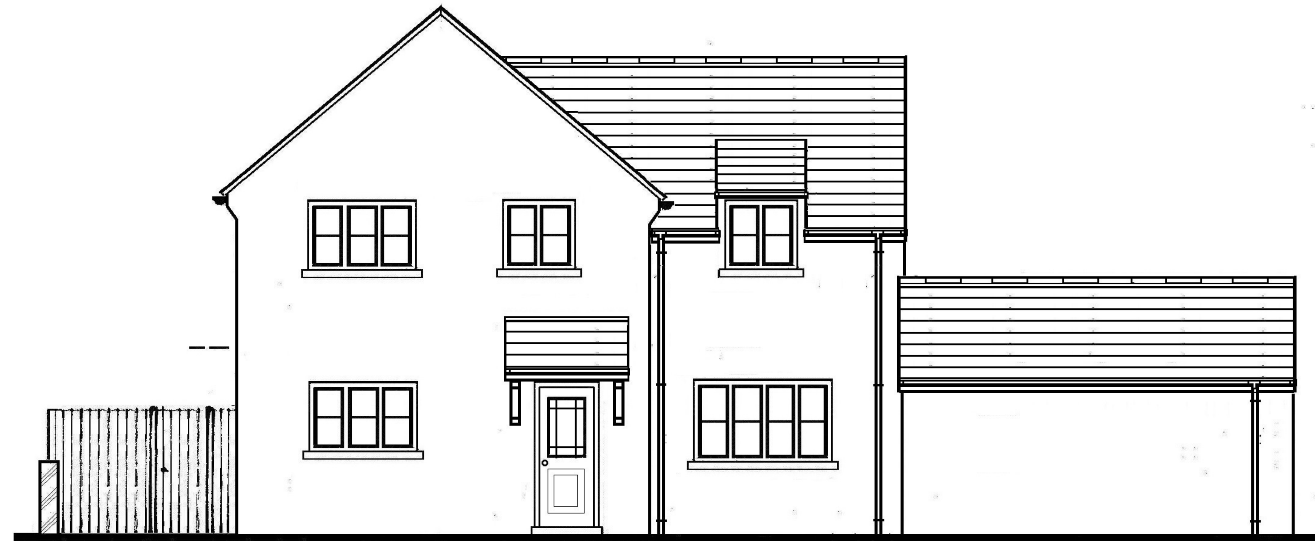
FRONT ELEVATION (WEST) onto BARNES CLOSE

PROPOSED MATERIALS Walls - White render with artstone cills Roofs - Blue/grey Welsh slate with artstone watercourse Windows - painted s/w casement