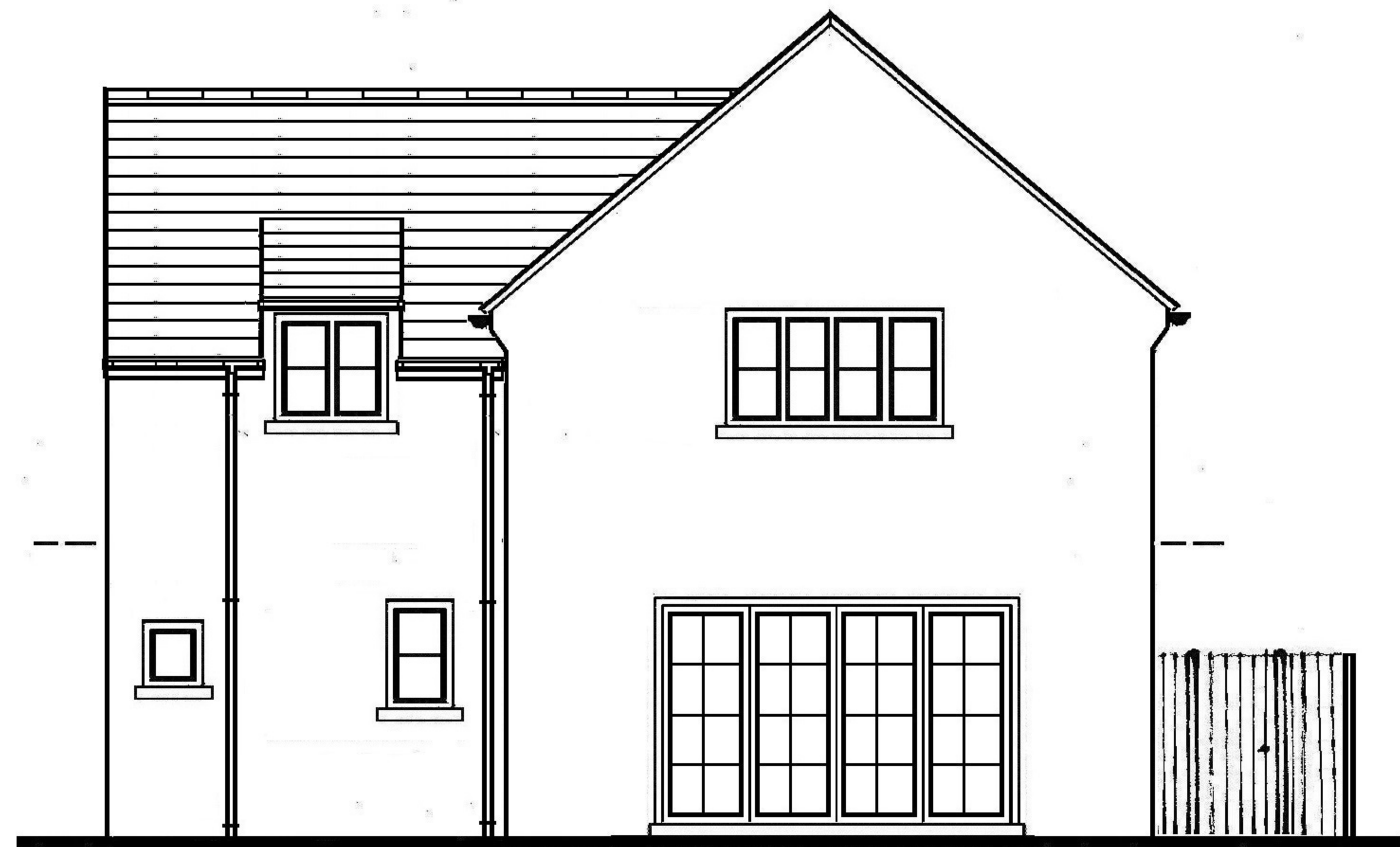
REAR ELEVATION (EAST)